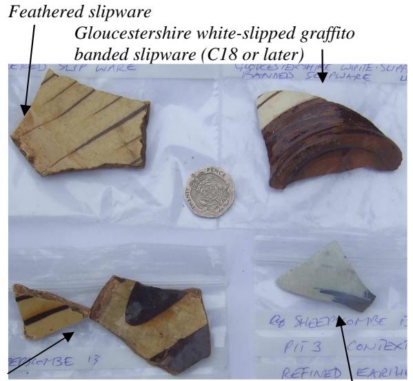
Feathered Slipware, possible Bristol, C18th Refined Earthenware