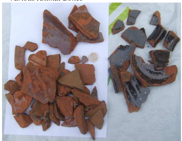
Local red clay pots, with red and black glaze. There were potters in Cranham and Painswick

This type of clay pot was typical for a long period from the thirteenth to nineteenth centuries.