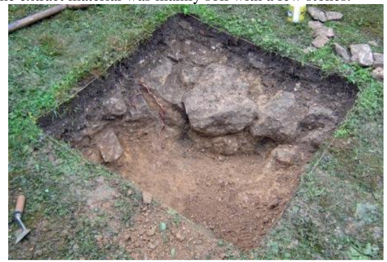
(photos 23,44). The finds appeared mainly nineteenth century and included window glass and lead glazing bars, small coal fragments, pottery, china, bottle glass and a slate pencil.