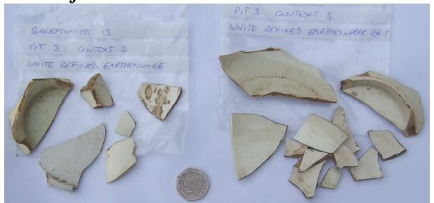
White Refined Earthenware –eighteenth or nineteenth century