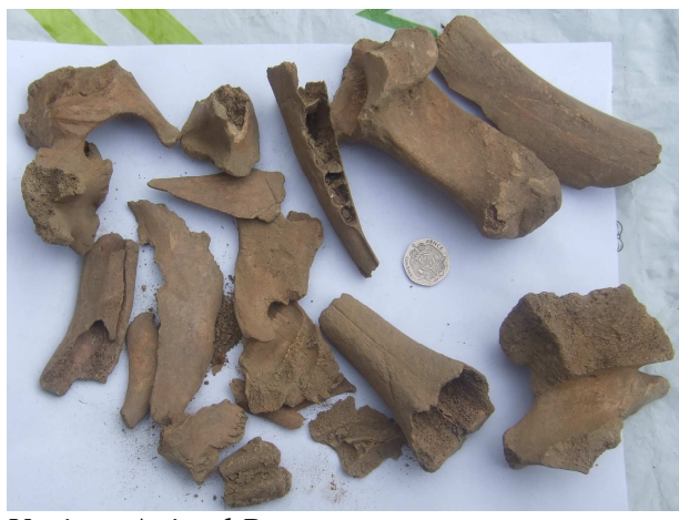
Various Animal Bones